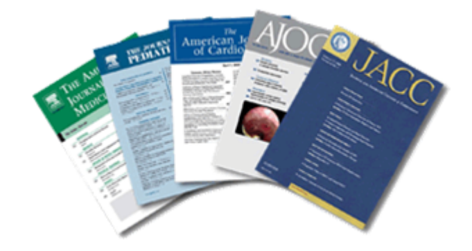
Key Funding and Publications with High JIF